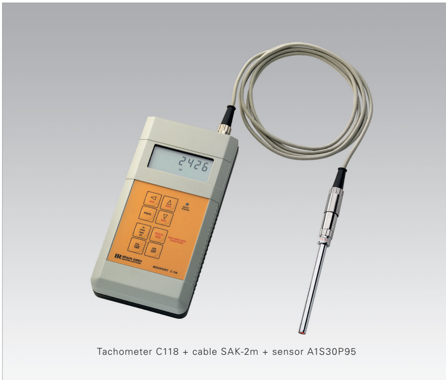
Tachometer C118 + cable SAK-2m + sensor A1S30P95