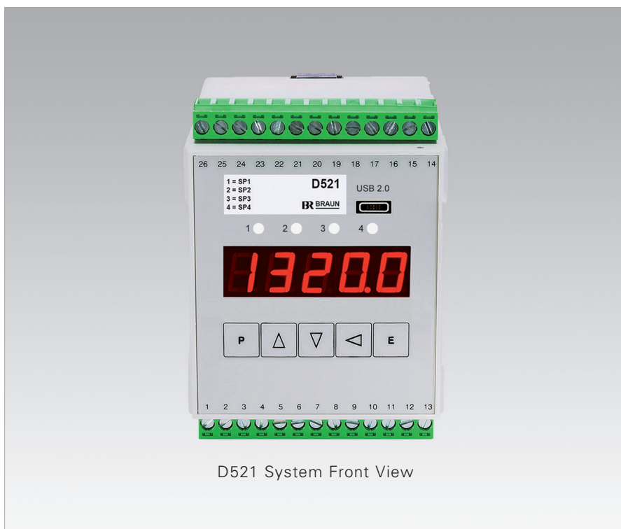
D521 System Front View